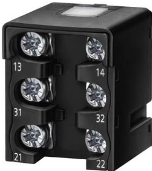
CONTACT BLOCK FOR POSITION SWITCH 3SE51/52 2NO/1NC SLOW-ACTION CONTACT