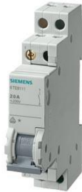
switch disconnecter, on-off switch 32 A 3 NO + N terminal 6 mm 2