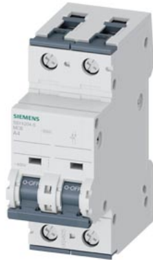
Miniature circuit breaker 400 V 10kA, 2-pole, A, 4A, D=70 mm