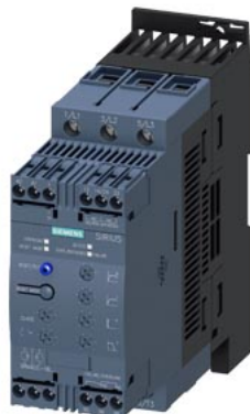
SIRIUS soft starter S2 63 A, 30 kW/400 V, 40 °C 200-480 V AC, 110-230 V AC/DC Screw terminals